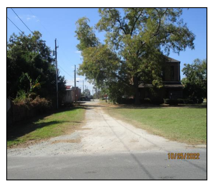
Site of Walking Trail Loop Extension in Nashville

The Southern Georgia RC's Community & Economic Development Division prepared six of the ten approved grant applications in this region.