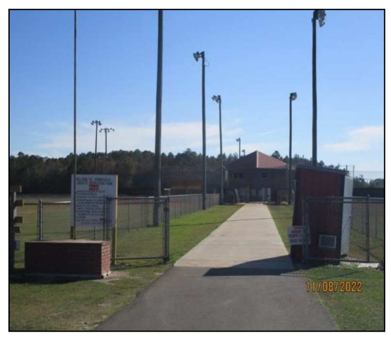
Homerville-Clinch County Recreation Park