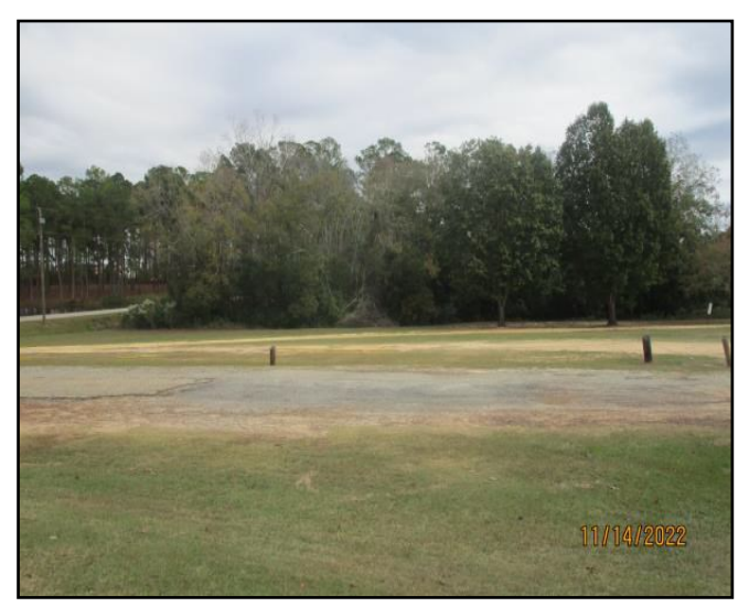
Site for additional soccer fields in Coffee County

2. City of Douglas - $1,684,207 – Construction of recreational facilities at Huckaby Sports Complex