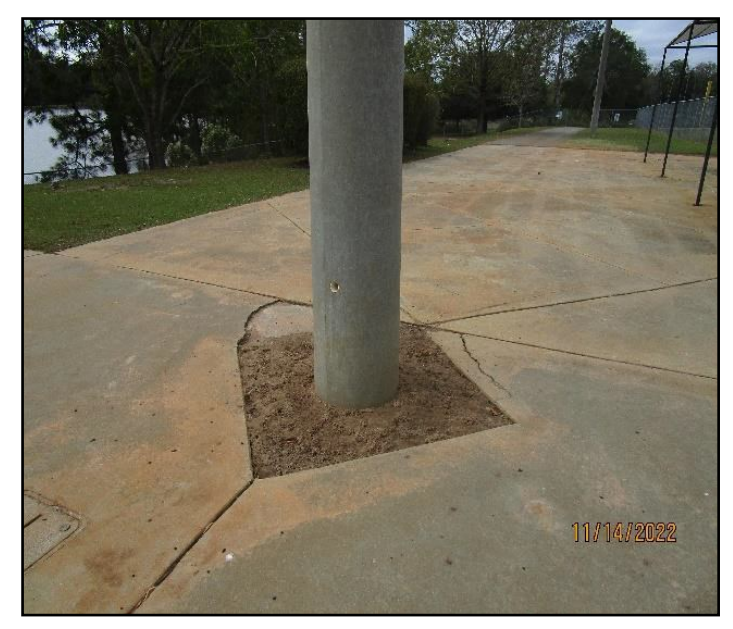
Huckaby Sports Complex in Douglas