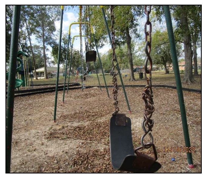
Roundtree Park in Douglas