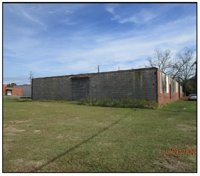
Demolition of existing building and construction of new recreation complex in Ben Hill County